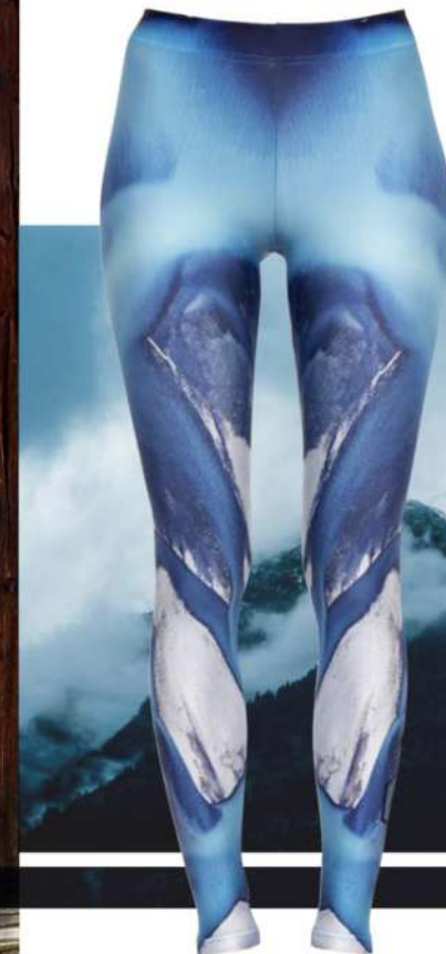
NEW ZEALAND LEGGINGS CODE: NZSPRING8/10/12/14