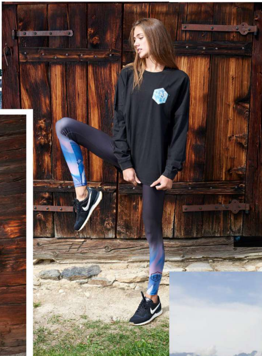
ROSE LEGGINGS CODE: ROSE8/10/12/14